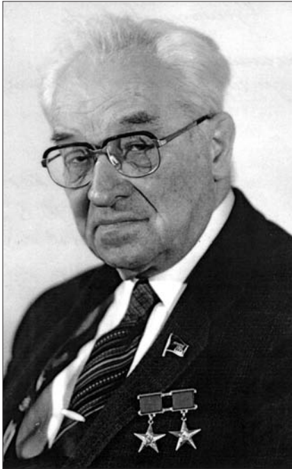
Figure 3. Kotelnikov in later years

army seemed likely to reach Moscow, Kotelnikov's laboratory, together with other scientific establishments, was evacuated to Ufa, around 1000 km to the east. There the laboratory continued to work on secure radio telephony, and by the beginning of 1943 such equipment was being produced on a large scale for the Red Army, having been tested the year before during the battle of Stalingrad. The encryption equipment was later used during negotiations at the Tehran, Yalta, and Potsdam Conferences.