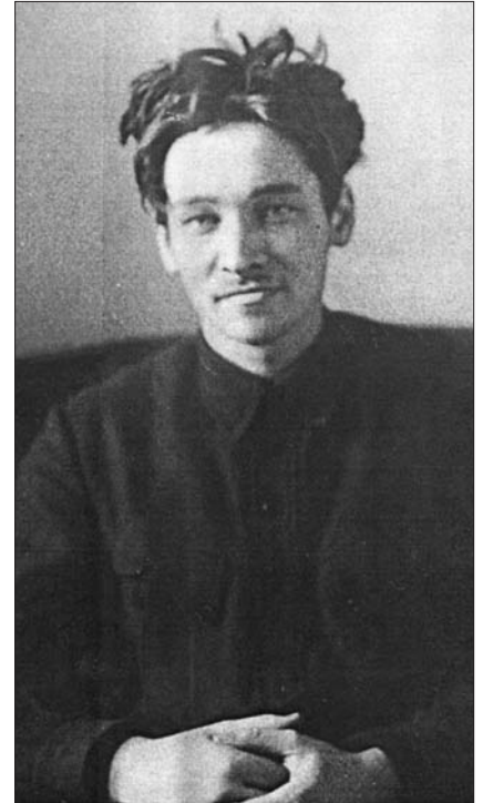
Figure 1. Kotelnikov as a young man.

At the present time no technique along these lines permits, even theoretically, the capacity of the "airwaves" or a cable to be increased any further than that corresponding to "single side-band" transmission. So the question arises: is it possible, in general, to do this? Or will all attempts be tantamount to efforts to build a perpetual motion machine?