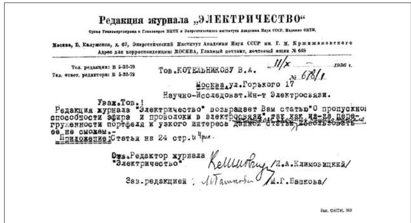
Figure 2. “The editorial board of Elektrichestvo is returning your article ...”

In the period immediately before the entry of the USSR into the Second